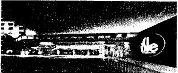
Isle Casino & Hotel Bettendorf, IA